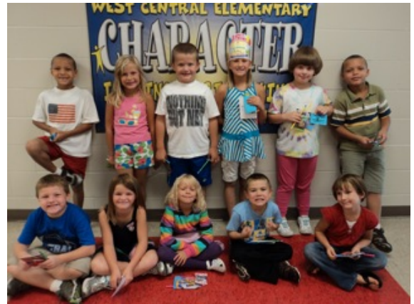
September First Grade Birthdays